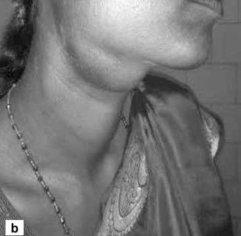
Figure 1 a and b. Swelling below the right angle of the mandible.