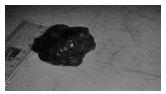
Figure 3. Excised gland.