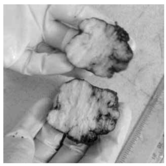
Figure 4. Cut section of the gland.

with the diagnosis of pleomorphic adenoma (Fig. 5). The microscopic picture showed proliferation of both epithelial and stromal elements.