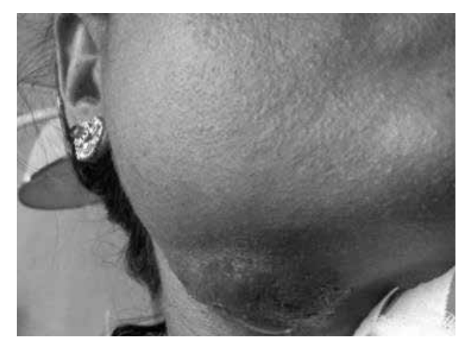
Figure 6. Healthy wound on 10th day postoperatively.