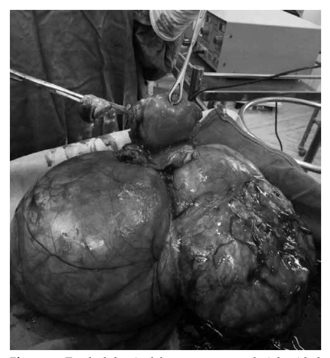
Figure 5. Total abdominal hysterectomy and right-sided salpingo-oophorectomy specimen showing huge central cervical fibroid with normal uterus on top.