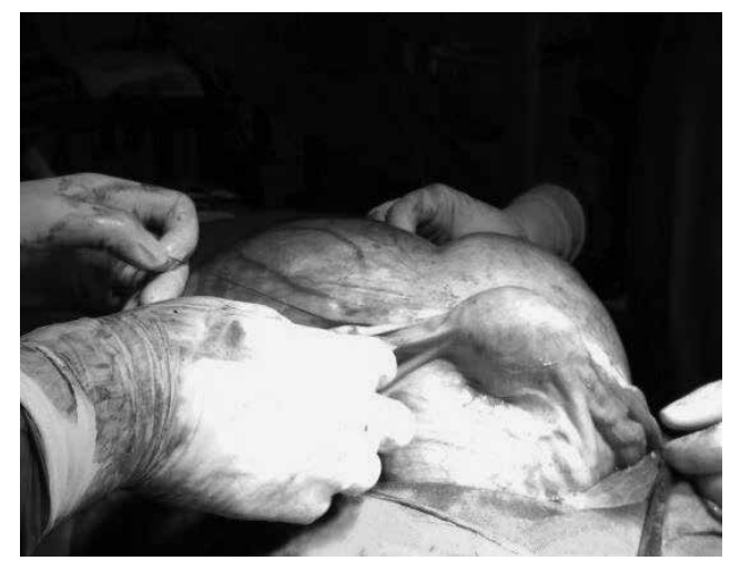
Figure 2. Normal uterus and ovaries sitting on top of the central cervical fibroid "Lantern on top of St. Paul's cathedral".