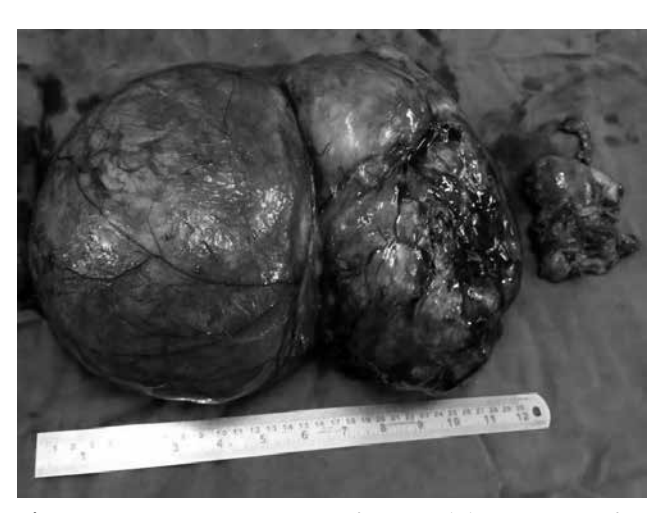
Figure 6. Gross appearance of cervical leiomyoma after resection.

internal iliac artery ligation done to secure hemostasis of the fibroid base. Bilaterally ureters were traced till bladder and found intact. Abdomen was closed in layers after placing intra-abdominal drain and taking count of the instruments and the mops. The mass with uterus weighed 5.5 kg. Cut section revealed a firm mass with whorled appearance and pseudocapsule.