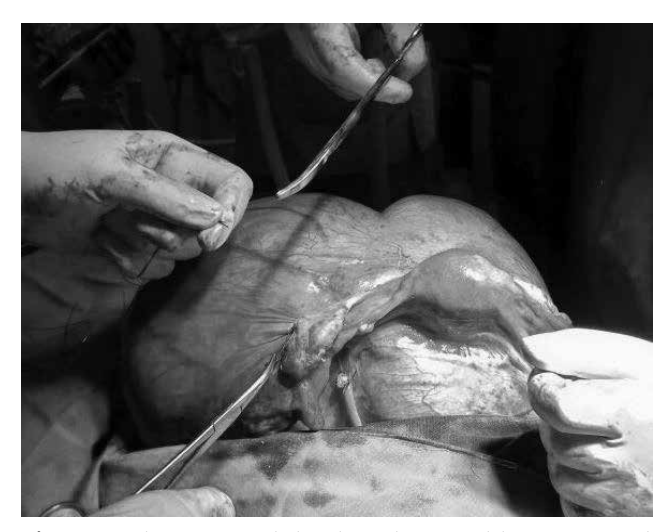
Figure 3. Clamping and dividing the round ligaments and the ovarian vessels.