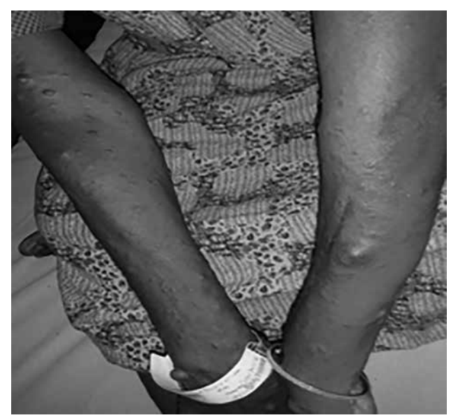
Figure 2. Both arms showing multiple neurofibromas of varying sizes.