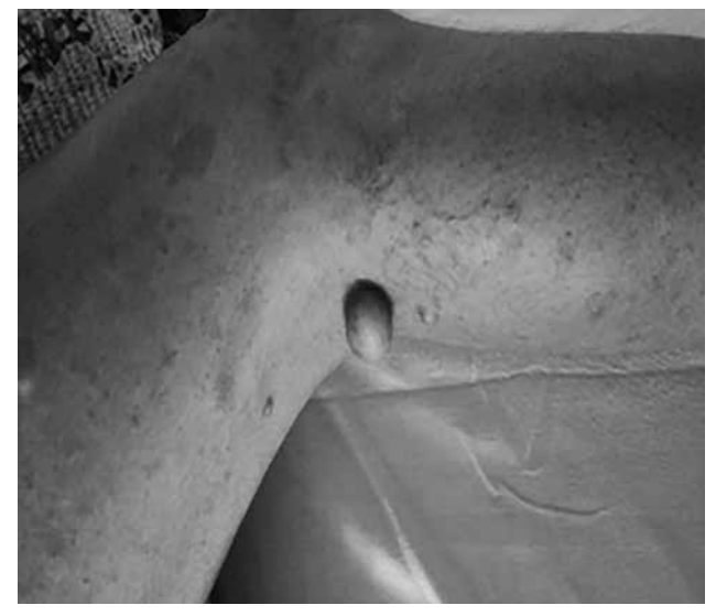
Figure 1. Single, small neurofibroma seen on lateral aspect of the left knee.

In the same region, the patient presented with the present swelling. On excision of the mass, histologically it showed an undifferentiated pleomorphic sarcoma (Fig. 3), which was confirmed on immunohistochemistry