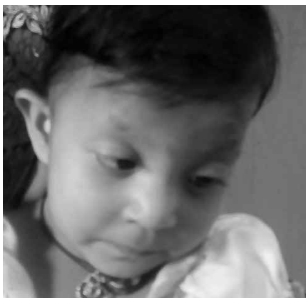
Figure 2. Ear anomaly.