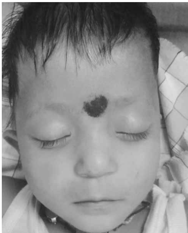
Figure 1. Facial anomaly.

7 months, bi-syllable sound at 2 years, walked with support at 2 years. Baby was having head circumference of 40 cm, weight was 9 kg, mid-arm circumference was 12 cm, antimongoloid slant of eyes, brachycephaly, small jaw, broad and short nose, short neck, epicanthic fold, large mouth (Fig. 1), malformed auricle (Fig. 2),