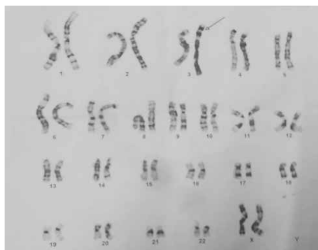
Figure 4. Chromosomal anomaly showing 3p duplication.

reduced muscle tone, seizures, growth retardation, mental retardation and speech retardation. On evaluating the child, completed blood count was normal. Electroencephalograms (EEG) show normal sleep-wake cycle and normal EEG, CT brain showed no apparent anomaly (Fig. 3), on chromosomal analysis there was presence of duplication of segment between 3p22 and 3p25 (Fig. 4). For recurrent seizures, child was treated with levetiracetam and valproate, dietary modification advice and developmental counseling was properly given.