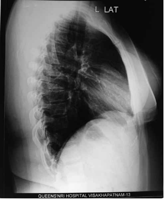
Figure 3. Lateral view of chest delineating soft tissue density in the breast and no parenchymal lesion.

review found no evidence of increased incidence of malignancy in other organs. <sup>1</sup> The American Association of Rheumatology opined that there is no increase in