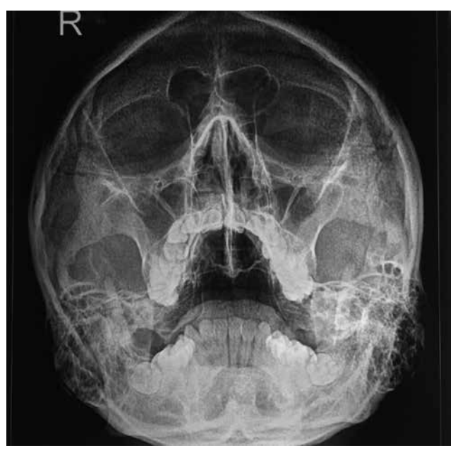
Figure 1. X-ray paranasal sinus demonstrating bilateral maxillary sinusitis.

Silicone breast implants were first introduced in breast reconstruction surgery in 1964. Since then, implants further evolved over time. Either they can be filled with silicone gel or saline. Breast implants can be