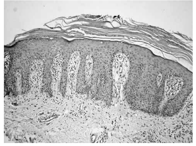
Figure 3. Histopathologic section of the psoriatic plaque.

The following week, he was administered second dose of intramuscular injection methotrexate 7.5 mg. As there was a subsidence in his lesions, he was discharged with oral methotrexate 7.5 mg, once a week in three divided doses at 12-hourly interval along with folic acid supplement. His hematologic, hepatic and renal profiles were within normal limits on review after 2 weeks and after 4 weeks and we noticed near total resolution of his lesions.