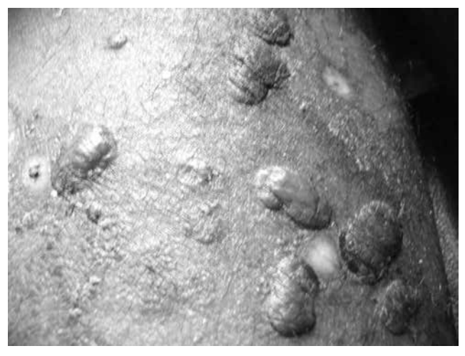
Figure 1. Multiple tense bullae over the anteromedial aspect of right thigh.

Routine blood investigations were within normal limits except for raised erythrocyte sedimentation rate (ESR) of 35 mm at the end of 1st hour and neutrophilic leukocytosis seen in peripheral smear. Tzanck smear