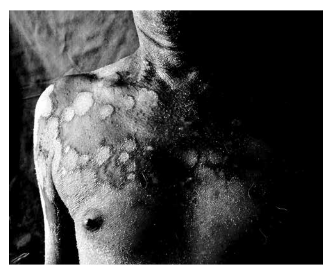
Figure 2. Multiple erythematous coalescing plaques.

from a fresh bullae revealed inflammatory cells. He was subjected to skin biopsies from 3 sites; first one from a psoriatic plaque on the right thigh, second, an intact bulla on the left thigh and the third one from normal skin over left thigh which was sent for direct immunofluorescence. Histopathologic findings of the first specimen confirmed psoriasis (Fig. 3), that of the second specimen was suggestive of bullous pemphigoid as it showed a blister at the subepidermal region containing few neutrophils, eosinophils, lymphocytes and fibrin along with mild inflammatory infiltrate in the dermis (Fig. 4). Direct immunofluorescence demonstrated deposits of immunoglobulin G (IgG) and C3 in a linear pattern along the basement membrane zone confirming the diagnosis of bullous pemphigoid.