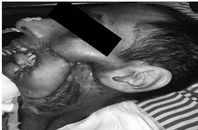
Figure 2. PMMC flap covering part of the defect after taking down the free flap, preauricular area still left uncovered.