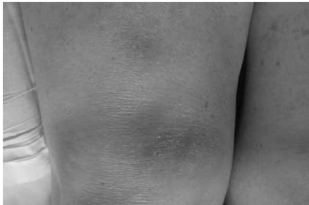
eFigure A. Erythema nodosum is a red, painful, tender, nodular lesion most commonly located in the front of the leg below the knee. It ranges in size from 1 to 5 cm and is caused by inflammation in the fatty layer of skin.