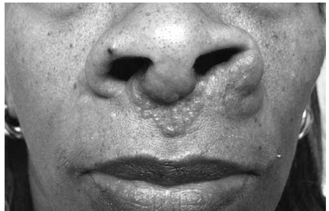
eFigure B. Lupus pernio is characterized by chronic, raised, indurated, bluish-red or violaceous nodules and plaques over the nose, cheeks, and ears. It is thought to be pathognomonic of sarcoidosis.