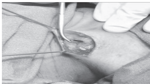
Figure 1. Cannula sheath within the right EJV seen at exploration.

Phlebotomy done and cannula sheath removed safely (Fig. 2). Complete hemostasis was achieved and skin was closed with staplers. Patient was then inserted central venous line in left subclavian vein. She was managed in ITU for another 4 days and after complete resolution of pancreatitis, she was shifted to general ward and discharged from there after 2 days.