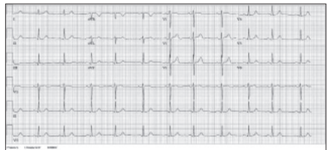
Figure 3. Tracing within normal limits.

Patient responded well to doxycycline and other supportive care; his condition improved with treatment over the next 48 hours. On Day 6, patient's blood pressure was 120/80 mmHg. He was slowly weaned off inotropic support. ECG was tracing within normal limits (Fig. 3). Review 2D-Echo was done after 2 weeks which revealed resolution of left ventricular function